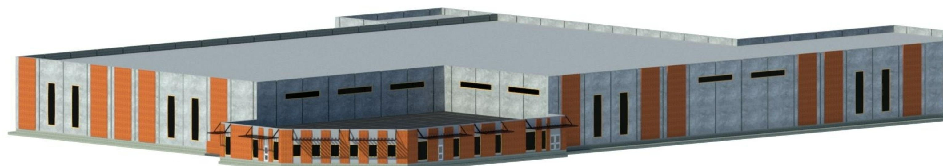
Figure 1. Facility exterior rendering.