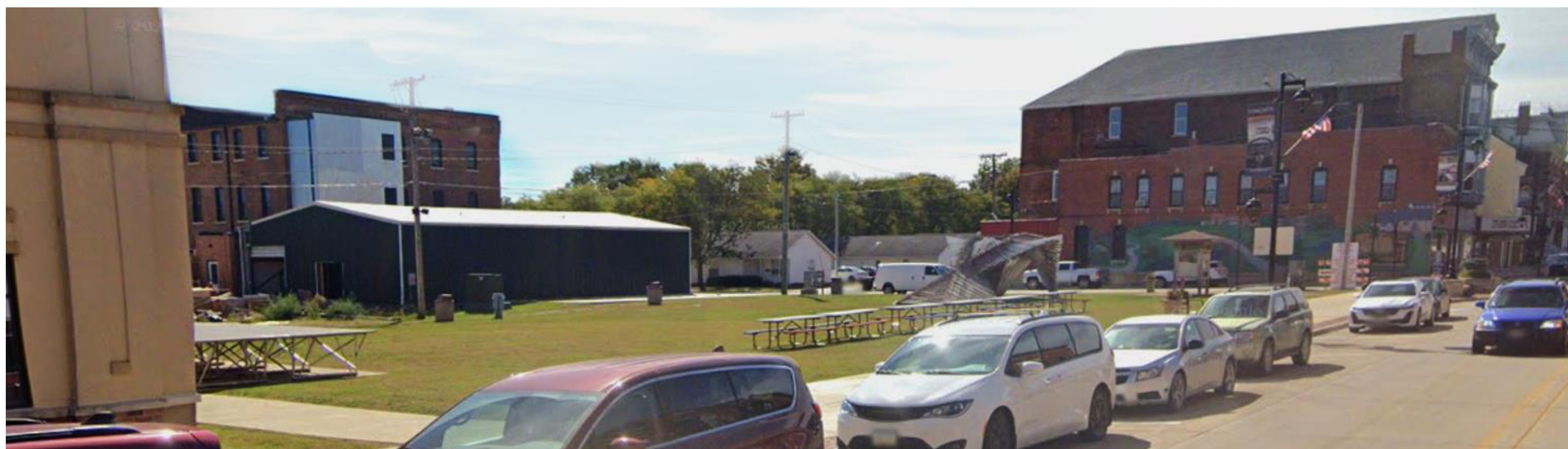
Figure 1. Current state of green space.

The green space to be redeveloped is located at the NE corner of S Main St and E Pleasant St. This corner is home to several popular Maquoketa events like the summer concert series, Maqtoberfest, Fireball, and more. The space, however, lacks the amenities necessary to comfortably host these events. Our redevelopment project will provide the green space with a permanent stage, restroom and storage structure, lighting, and shade to meet the needs of event-goers.