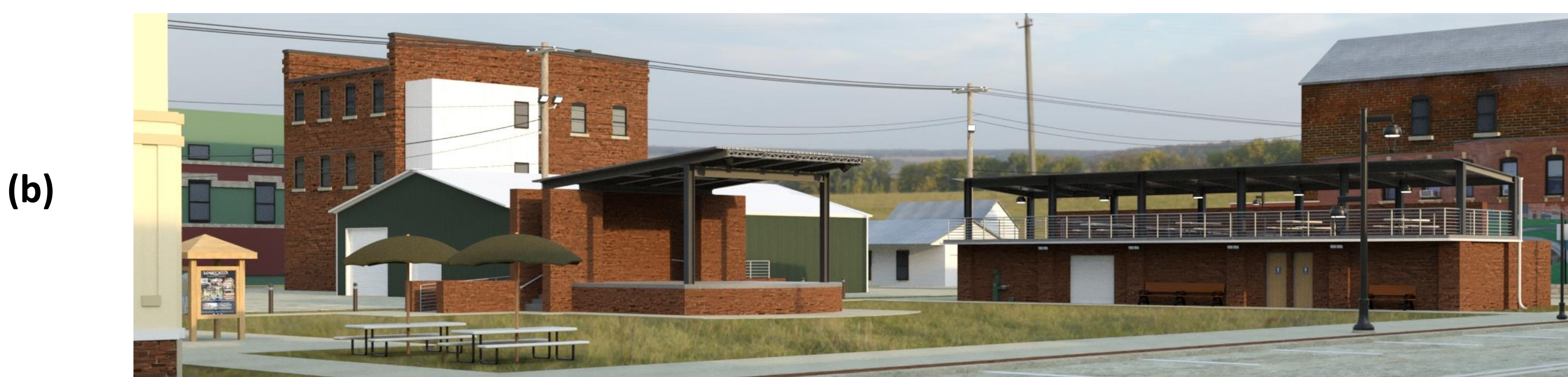
Figure 2. Proposed green space design: (a) site plan phasing, (b) site rendering.