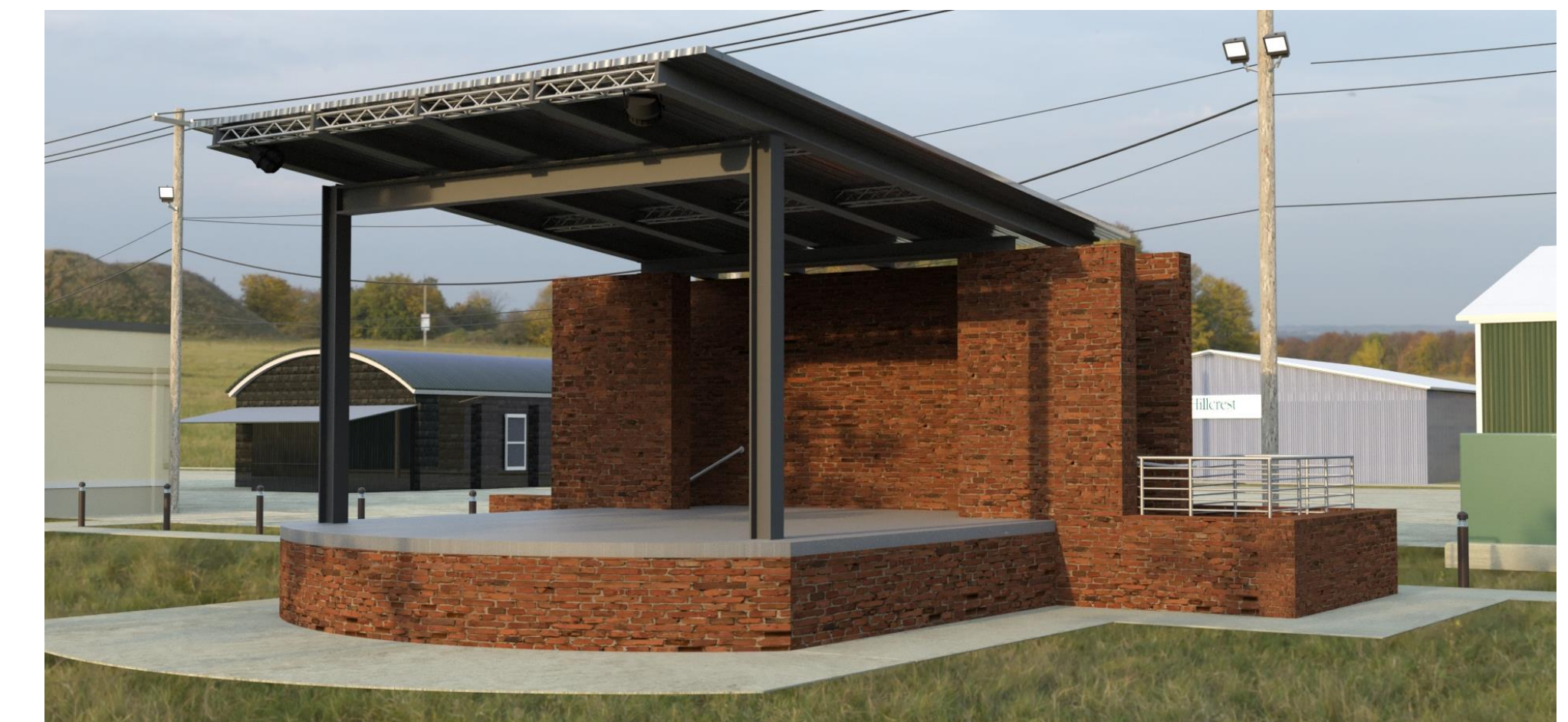
Figure 3. Stage structure.

The stage size (26' x 20') was selected to accommodate all the performances the city of Maquoketa desires to host. Its placement on the east side of the site provides a more personal experience between the audience and the performers. There is also an ADA compliant ramp and stairs to the stage.