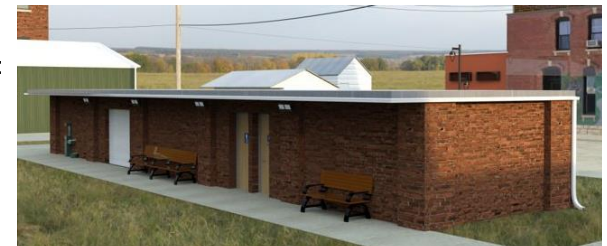
Figure 4. Phase one restroom structure.

The restrooms were designed for usage of a 390-person audience. There are men's and women's restrooms with a storage room that has garage door access.