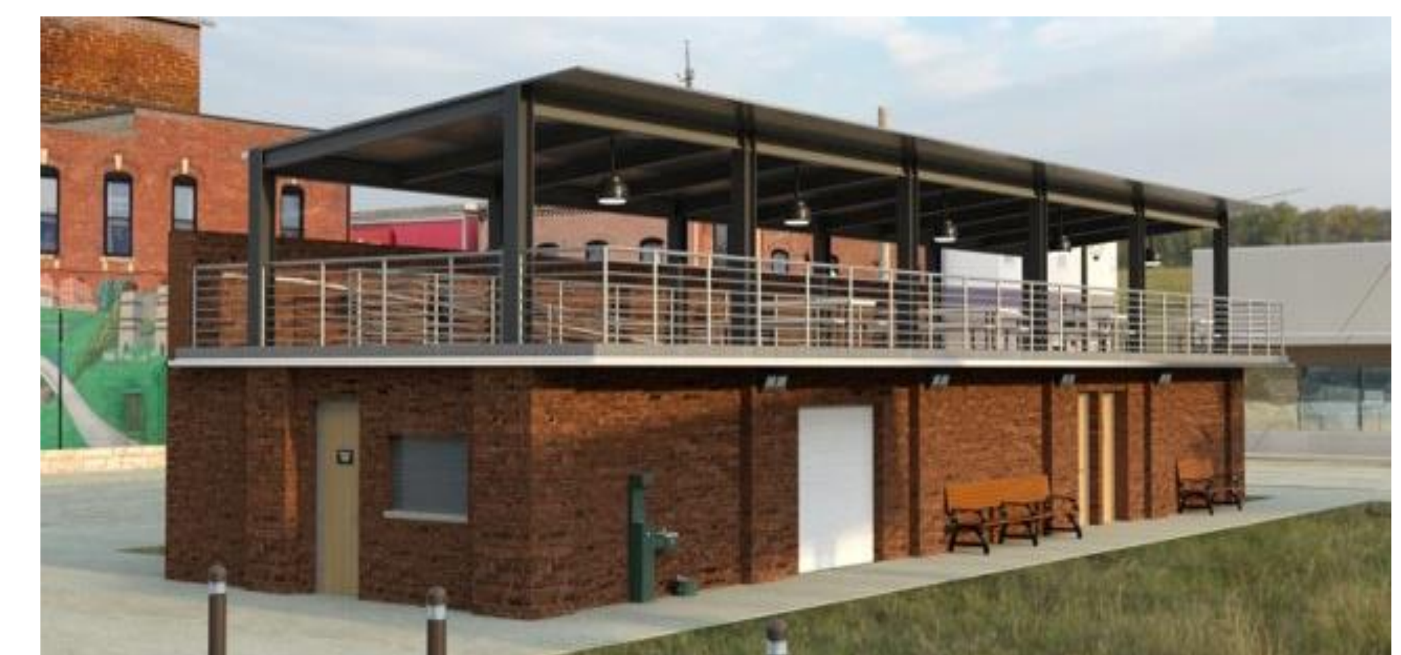
Figure 5. Phase three restroom structure.

This final phase offers shade as well as solar energy through the implementation of a permanent steel roof with solar panels mounted. Phase Three also introduces a concessions area which will complement the food trucks during events.