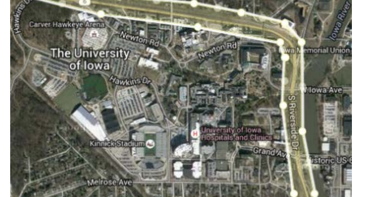
Figure 1: Investigation area on Highway 6

The research for this report began with preliminary site visits, in which the study area was divided into half-mile sections and