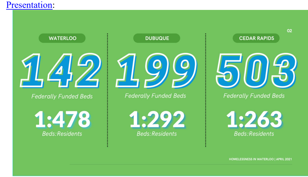
Figure 2 - Presentation Screenshot

The findings from our research, and conversations with stakeholders in Waterloo, resulted in this presentation made on April 29, 2021. Below is the link to our presentation on Homelessness in Waterloo. Included in this presentation are brief overviews of the sections in our Memo.