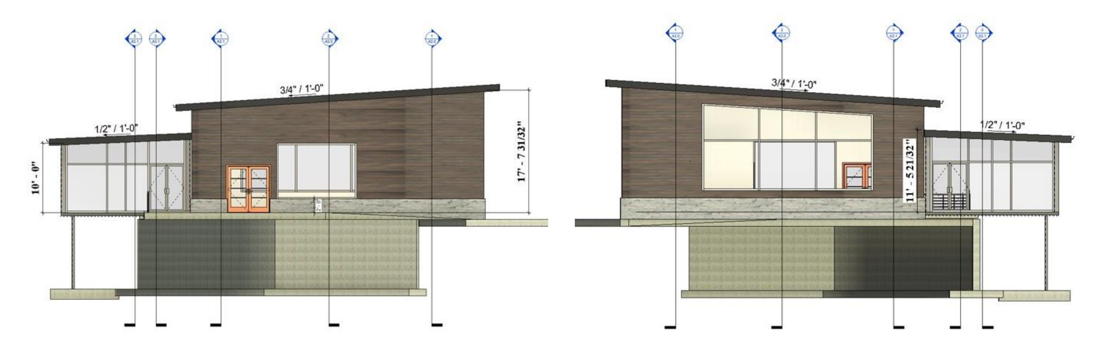
Figure 3. East and West Elevation Views of the Building

The building will consist of a wildlife exhibit area, a conference room for educational presentations and activities, and an indoor viewing area overlooking the valley.