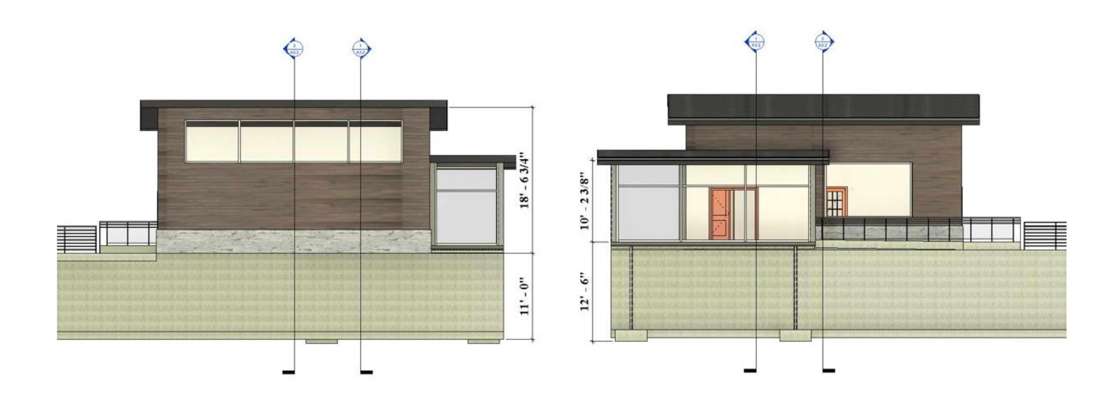
Figure 4. North and South Elevation Views of the Building